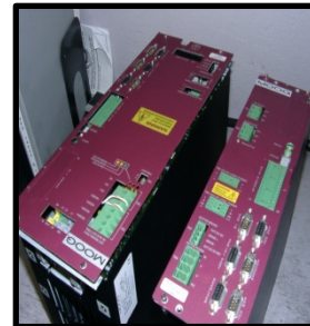
Moog T200 Series Servo Drives