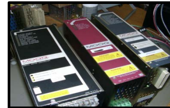
T164 Series Servo Drives & Power Supply