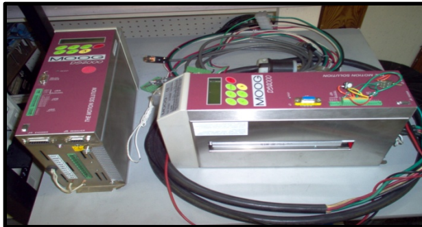
DS2000 Moog Drive

The K+S Lawton facility is now able to repair and fully load test the T200, T164, and DS2000 series of Moog servo controllers and power supplies. Each controller is carefully evaluated, the necessary repairs and preventative maintenance is then performed. The unit is then fully load tested on the hydraulic load stand to ensure that the controller can source the maximum current. Moog servo controllers with the built in power supply option are tested on the mechanical load stand to fully diagnose & test the internal and external regenerative functions of the drive. All ports on these Moog servo controllers are fully function tested to guarantee a quality repair every time.