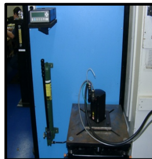
Hydraulic Load Stand